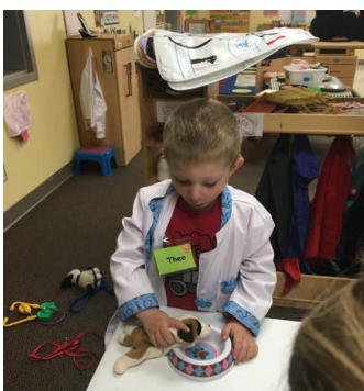
Caring for pets in our veterinary clinic dramatic play area

Enrollment for fall is steadily increasing. We have only four spots left in our M/W/F co-op 4s class. Continue to spread the word to friends and neighbors! Our preschoolers attended field trips at the end of April. Our threes class visited a farm where one of the students lives, our morning fours class visited Hardings at Woodbridge where one of the students' father is the manager and our afternoon fours class visited the Air Zoo. The first week of May we will be holding a Trike-a-Thon to learn about bicycle safety and to raise money for St. Jude's Children's Research Hospital. We are excited for the nicer weather to play outside and a fun-filled month to wrap up our school year!