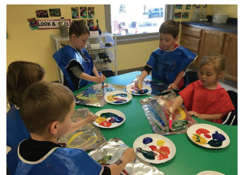
Painting on foil